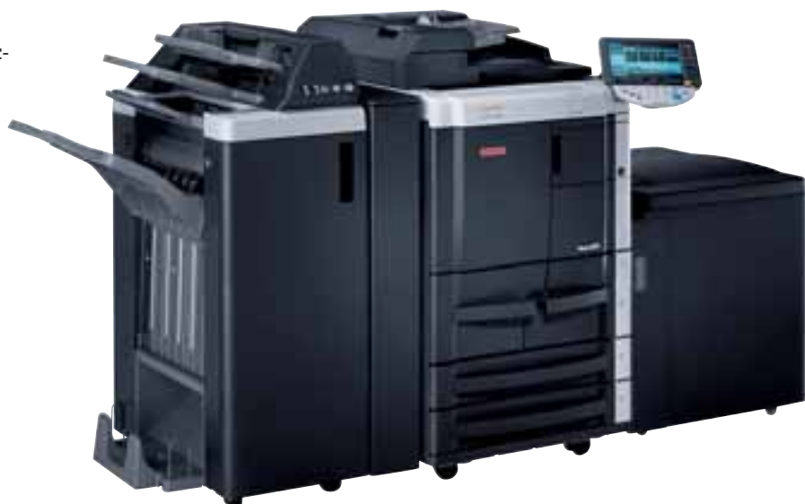
ineo 601 with booklet finisher FS-610, post inserter PI-504 and the large capacity tray LU-405