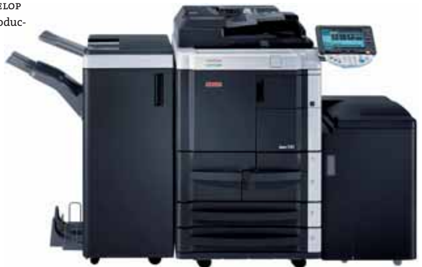
ineo 751 with booklet finisher FS-610, and the large capacity tray LU-405